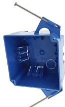
3 3/4" Square (Plastic)