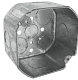
3 3/4" Octagonal (Metal)